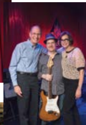
2015 Scientific Sessions Foundation Event