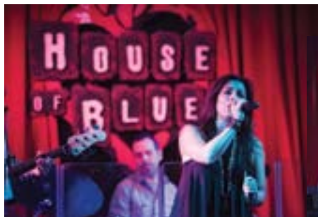
2015 Scientific Sessions Foundation Event