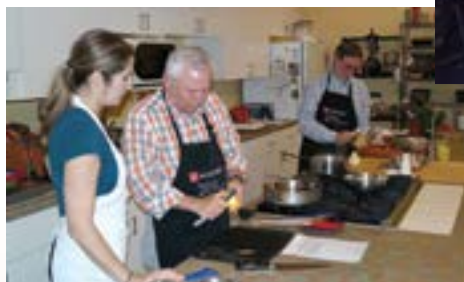
2015 Fall CLU Foundation Event